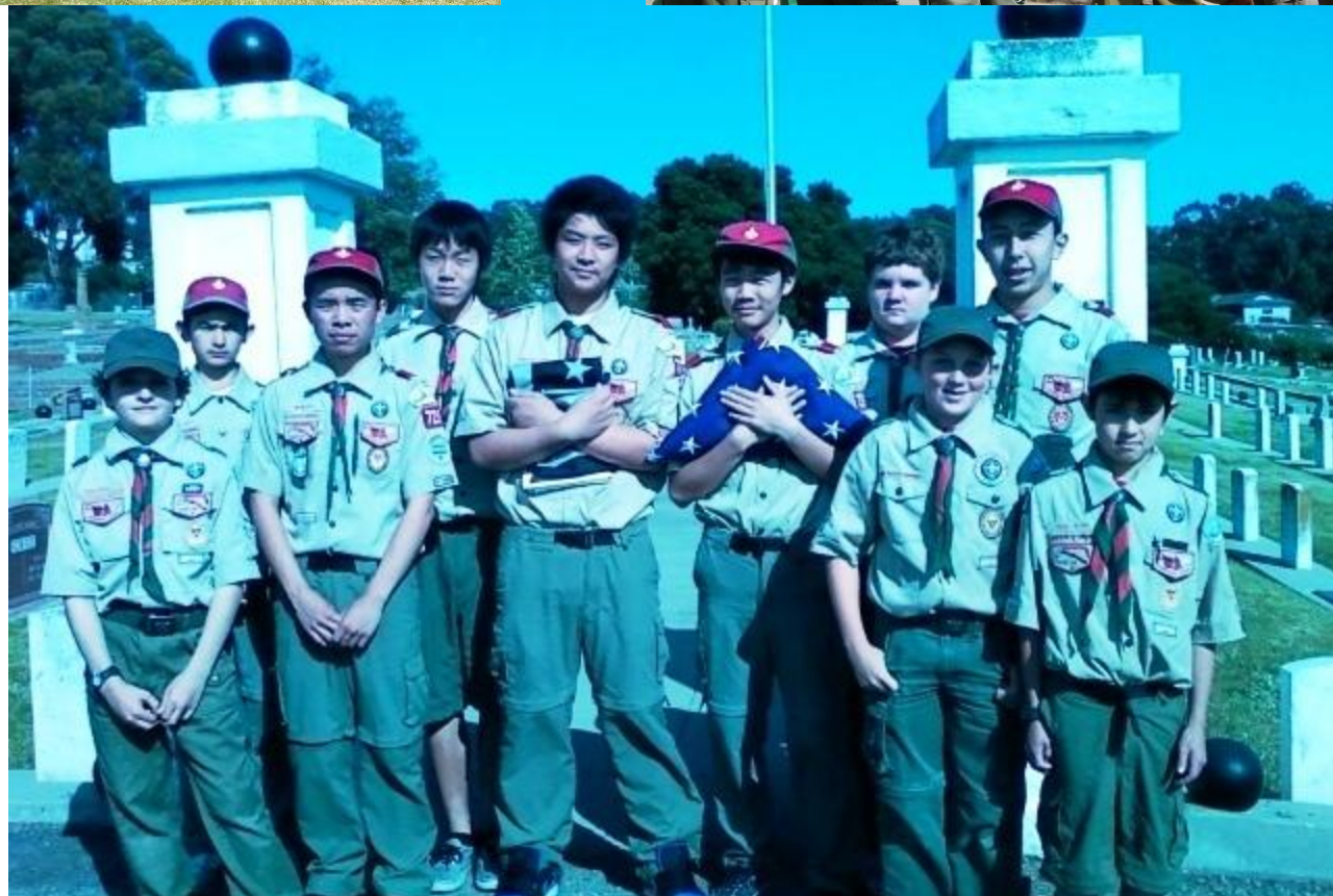
Taken on Monday after our scouts removed the flag and sorted all the flags, they were asked to retire the colors. They did a great job.