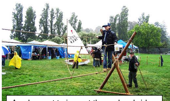
A cub scout trying out the mokey bridge